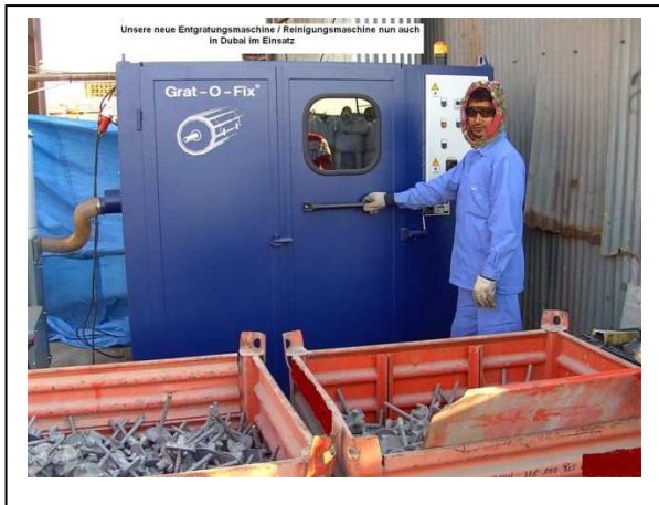
Model Grat-O-Fix ® 600 L in action in Dubai during the building Of the Burj Al Arab hotel