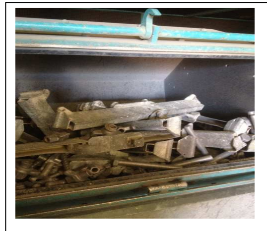
Drum filled with different size parts